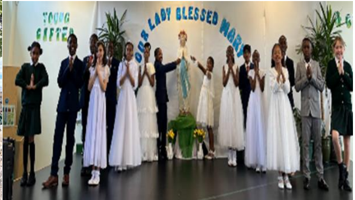
Marian Procession around the community and Crowning of Mary led by First Communion Recipients