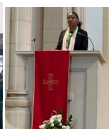
Staff, pupils, parents and governors participate fully in the celebration of whole school Liturgies (Masses) every half term and on special feast days and days of obligation.