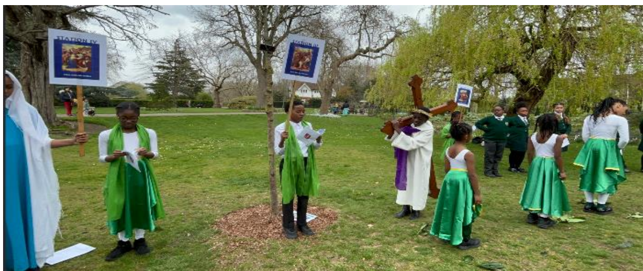
Our pupils bring the Stations of the Cross to life every year in the Church, school or West Ham Park for the whole school community to reflect on this most solemn journey of Jesus to the cross.