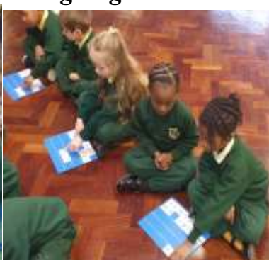
KS1 Partners in Phonics