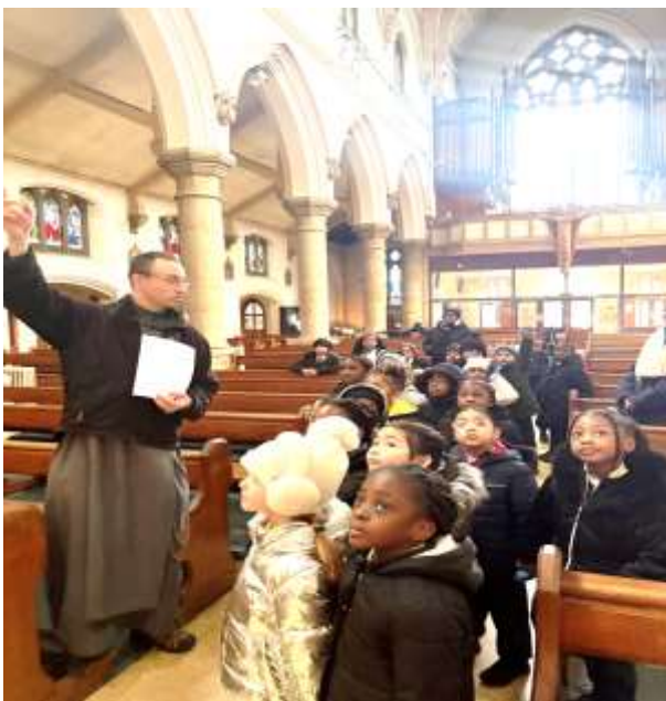
Y1 pupils' eyes filled with awe and wonder as They learn about symbols and signs in Church.