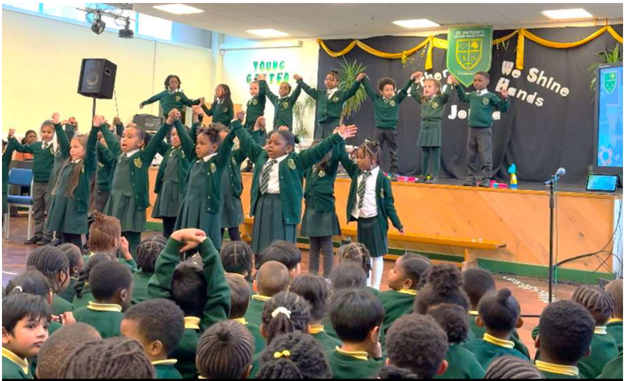
Year 1 embodies the principles of CLM in their assembly promoting our Motto: 'Working Together In God's Love' through their Class Assembly message: 'Together we shine when hands are joined'