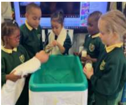
EFYS RE Baptism Role Play