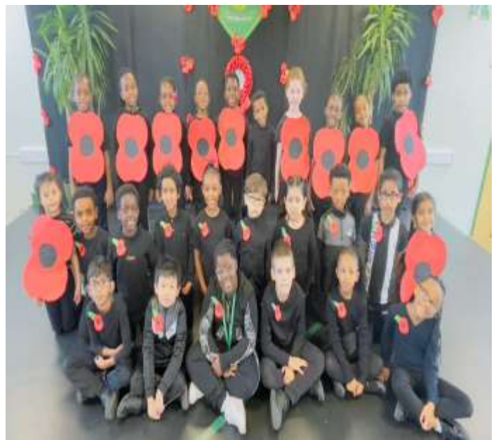
Y2 pupils commemorate remembrance by showing their respect and admiration for those who made the ultimate sacrifice

The Governors, Headteacher, Leadership and RE Team take their role of supporting members of the school community with growing in their faith very seriously. Engaging in a range of purposeful and intentional actions which form part of the pastoral care provision in place across the school catering to all pupils as well as staff and parents. They do this by: