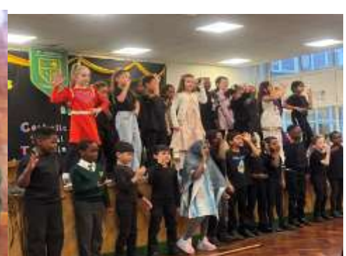
Y3 Catholic Social Teaching in Drama