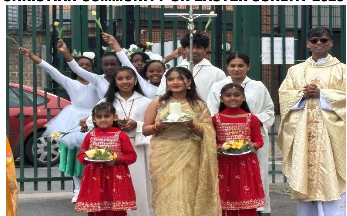
A long line followed in procession in a strong profession of faith