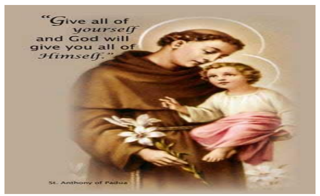
Our Vision at St Antony's sees our school with